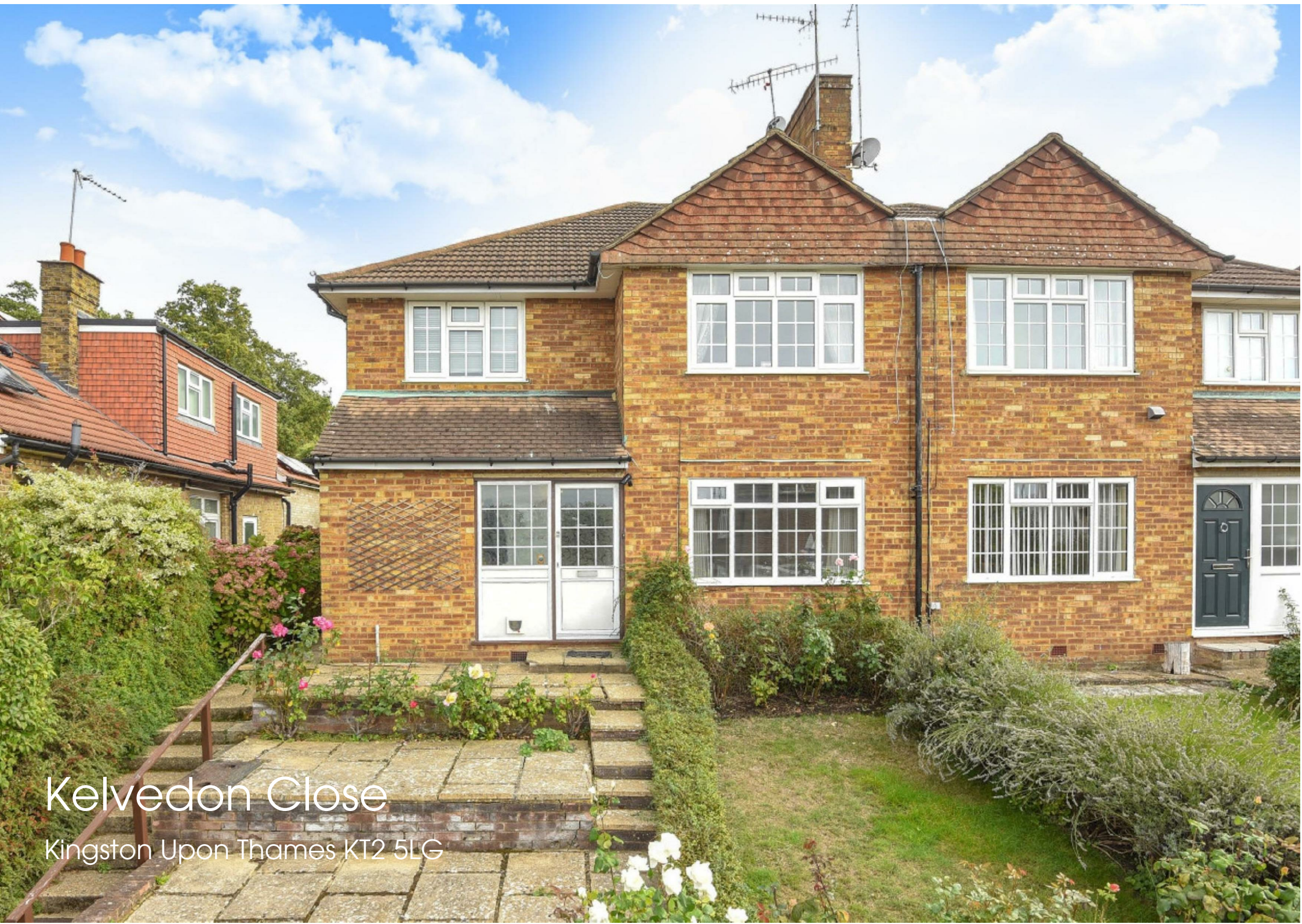
Kelvedon Close Kingston Upon Thames KT2 5LG